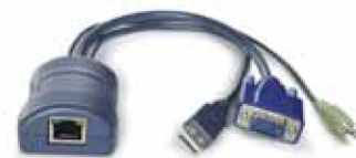
Example CAM: CATX-USB-A

CAM: Computer Access Module PS/2 only: CATX-PS2 PS/2 plus audio: CATX-PS2-A USB only: CATX-USB USB plus audio: CATX-USB-A Sun plus audio: CATX-SUNA Single Rack Kit: RMK-ALIP Dual Rack Kit: RMK-ALIP-Dual Serial upgrade cable: CAB-9M/9F-2M Slave power switch for connection to AdderView CATxIP 1000 or master power switch: PSU-8SLAVE Master power switch for connection to AdderView CATxIP 1000 or standalone Ethernet operation: PSU-8MASTER