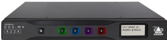
ADDERView CCS-MV 4224 - Front