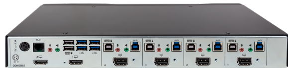
ADDERView CCS-MV 4224 - Rear