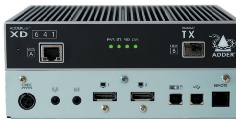
ADDERLink XD641 TX - Front & Rear