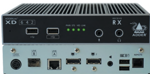
ADDERLink XD642 RX - Front & Rear

CAT6 is recommended for CATx extensions. CATx extensions are limited to 2 short patch connections. Patch cables should be CAT6 or better.