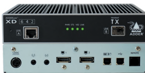
ADDERLink XD642 TX - Front & Rear